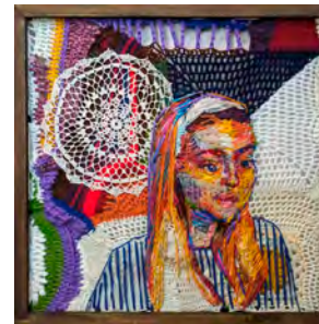
Interwoven Heritage by Keiko N. 1st Place, Grades 11-12, Teen Art Show 2024